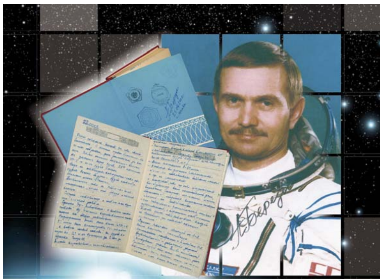
The astronaut Anatoli Nikolaievich Berezovoy and his diary

The diary by the Soviet astronaut Anatoli Nikolaievich Berezovoy is among the protagonists, on Saturday 27 at 21:30 (local time), in “Ulisse”, the Italian channel Rai 3 programme signed by Piero and Alberto Angela, devoted to science, ancient civilizations, places and masterpieces of art history.